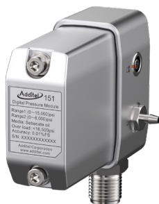
GP Pressure Module with Calibration Fixture

[1] A barometric pressure module is optional for ADT773/ADT783/ADT793. After inserting the barometric pressure module, the controller can be toggled to and from gauge and absolute pressure units.