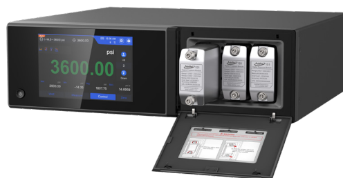
Additel 783 with ADT151 Pressure Modules