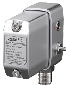
BP Pressure Module with Calibration Fixture