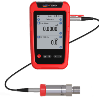
Additel 226Ex with ADT161Ex Pressure Module