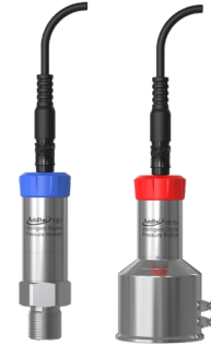
Gauge pressure Differential pressure