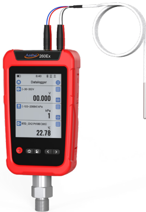
ADT260Ex with AM1602 temperature probe

Note: The ADT260Ex can be purchased without the ADT158Ex module if needed using the following part number: ADT260EX-NO