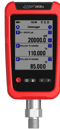
Additel 260Ex with ADT158Ex module