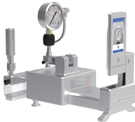
ADT710 with ADT109