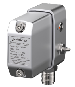
BP Pressure Module with Calibration Fixture